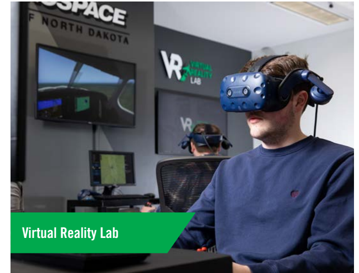
Virtual Reality Lab