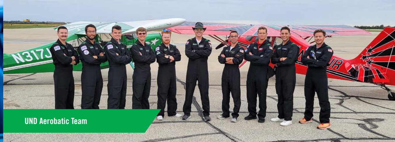
UND Aerobatic Team

“I am #UNDProud because of the amazing connections and resources that we are provided through the College of Aerospace Sciences. Connecting one-on-one with teachers through smaller classes encourages a brighter and stronger future. I am forever grateful for the opportunities I have had thus far and continue to receive through my time here at UND!”