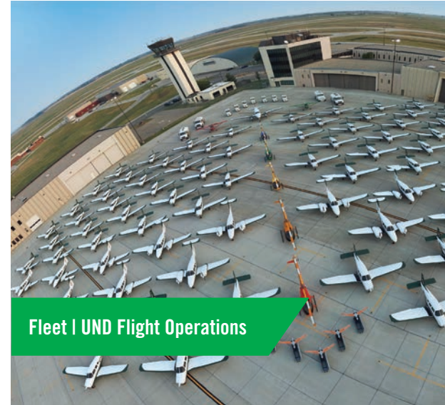
Fleet | UND Flight Operations

UND offers its students virtual reality (VR) training devices with customized software that closely simulates the Piper Archer. An immersive virtual environment and 360° view, combined with realistic hands-on flight control hardware, create an engaging flight simulation experience that allows for training opportunities not previously available in PC-based training devices. The VR training devices also offer the flexibility of simulating virtually any aircraft.