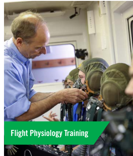
Flight Physiology Training